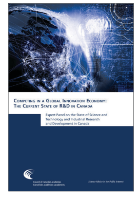
Competing in a Global Innovation Economy: The Current State of R&D in Canada (2018)