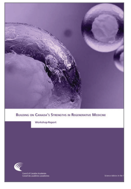
Building on Canada's Strengths in Regenerative Medicine (2017)