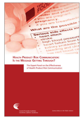
Health Product Risk Communication: Is the Message Getting Through? (2015)