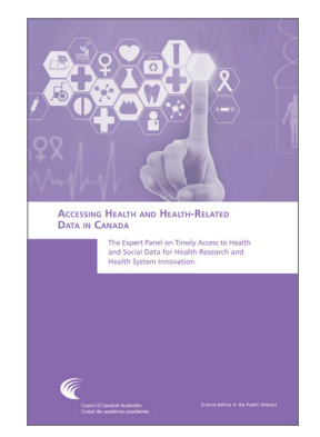
Accessing Health and Health-Related Data in Canada (2015)