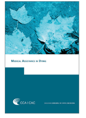
Medical Assistance in Dying (2018)