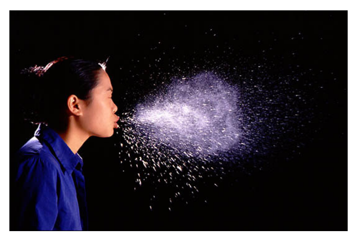
Particle mist created upon sneezing (Davidhazy, 2007).

There are two primary routes by which influenza virus exits the respiratory tract of an infected person: (i) expulsion of the virus into the air through sneezing, coughing, speaking, breathing or through aerosol-generating medical procedures, or (ii) by direct transfer of respiratory secretions to another person or surface. The new host acquires the virus either by inhalation of the infectious particles from the air or by contact with infectious material directly or via self-inoculation through a contaminated hand.