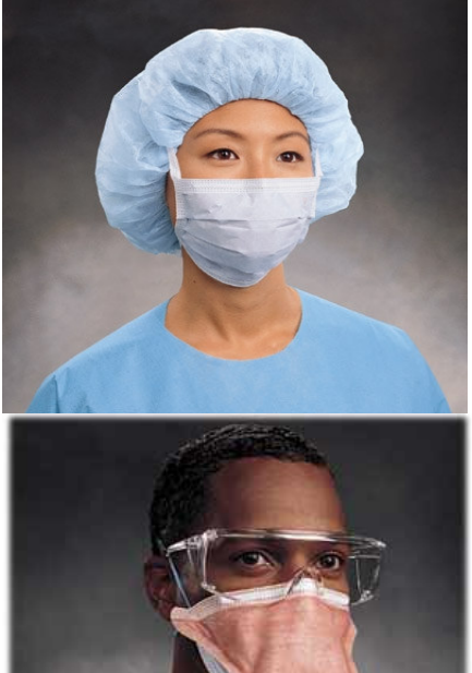
Photo of a Surgical Mask – These masks are not considered to be PPRE by Ontario Health and Safety Practitioners.

Surgical masks worn by infected persons may play a role in the prevention of influenza by reducing the amount of infectious material that is released into the environment. If worn to prevent exposure, surgical masks offer a physical barrier to contact with contaminated hands and ballistic trajectory particles. Their biggest limitation is that they do not provide an effective seal to the face, thereby allowing inhalable particles access to the respiratory tract. In addition, the efficiency of the filters of surgical masks in blocking penetration of tracheobronchial or alveolar-sized particles is highly variable and their efficiency in blocking nasopharyngeal-sized particles is unknown.