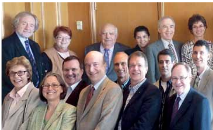
Members of the Expert Panel on the State of Science and Technology in Canada