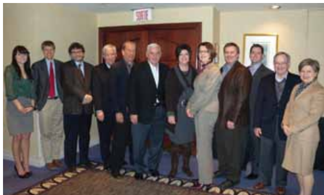
Members of the Expert Panel on Industrial Research and Development and Council Staff

Industrial research and development (R&D) is a means by which industries can grow by exploring and creating new products and services or improving existing ones. The state of industrial R&D in Canada has been the subject of numerous inquiries. Now, the Minister of Industry has asked the Council to assess the current state of industrial R&D in Canada, in particular, the strengths of industrial R&D and how those strengths are distributed by sector and geographically. The Expert Panel,