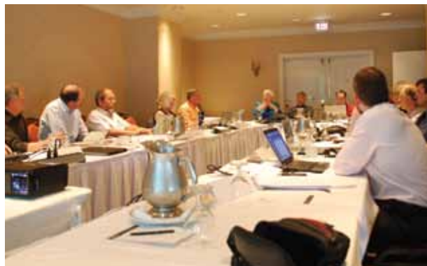
The Expert Panel on Water and Agriculture participating in a panel meeting.

The Expert Panel, chaired by Dr. Howard Wheeler, an international expert in hydrological science and sustainable water resource management, is expected to report in late 2012 or early 2013. Its report will assist in the adoption of public policies that will support uptake of sustainable practices in the agricultural sector to enable it to adapt to changing water supplies and maintain its resiliency.