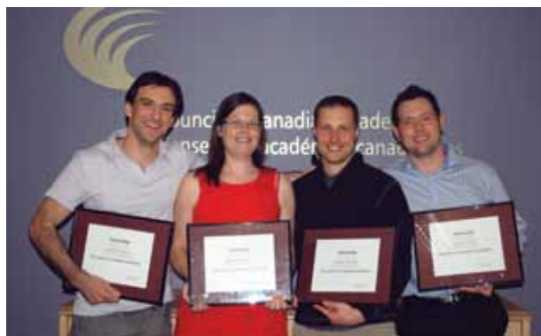
2012 Council Interns

The Council initiated the internship program in late 2009. To date the Council has engaged a total of seven interns through this program. The internship program was designed to provide participants with relevant experience in the area of science and policy. The program exposes successful applicants to the interface of the scientific enterprise and society, helping interns to determine whether they have the passion for the work involved.