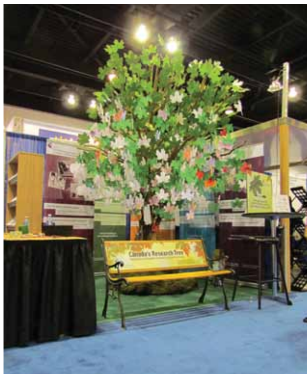
Canada's Research Tree, as displayed by the Council at the AAAS 2012 in Vancouver, B.C.

During 2011/12 the Council established an agreement with the Canadian Academy of Health Sciences to manage its office operations. This agreement aligns with the Statement of Common Understanding as it supports the sustainability of CAHS. Some of the highlights of the Council's administrative support for CAHS include the streamlining of membership collections and reducing administrative and operating costs. These initial efforts have led to more functional office operations for this Member Academy.