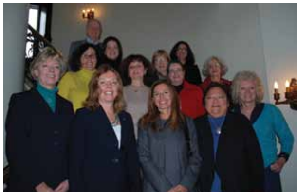
Members of the Expert Panel on Women and University Research

The report of the Expert Panel, chaired by Mr. Esko Aho, Executive Vice President, Corporate Relations and Responsibility, Nokia, and former Prime Minister of Finland, will provide important guidance to the province of Ontario to better target and evaluate its investments in innovation. Many other provincial governments have also expressed interest in this report. The final report will be released in the first half of 2013.